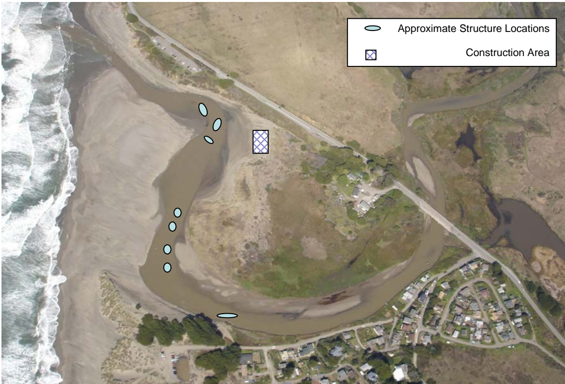
Figure 2. Site map of LWD structures to be constructed and installed in summer/fall 2010.

will be installed annually to provide additional cover and lower water temperatures in the summer and fall.